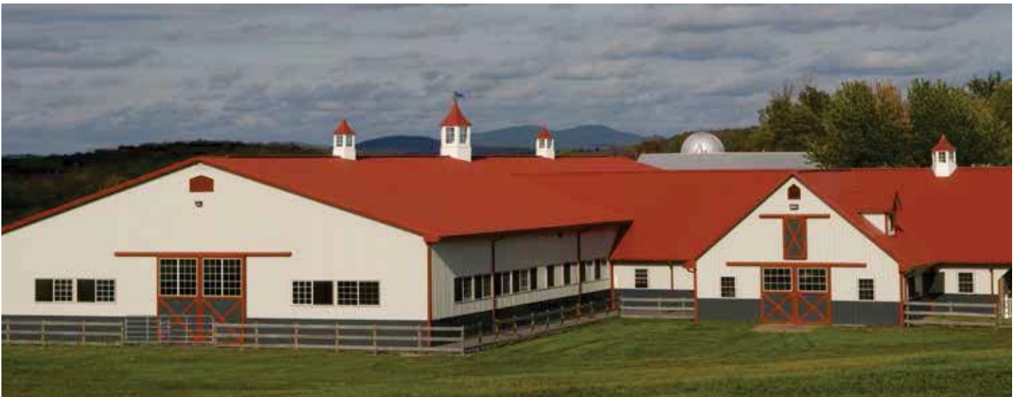
Roof Color: Brick Red; Wall Colors: Brite White and Charcoal Gray

StrongClad's high strength 29 gauge galvanized steel makes it perfect for post frame, agricultural and residential applications. A wide variety of colors plus excellent fire and hail impact resistance, makes StrongClad a beautiful yet durable choice for your roofing and siding needs.